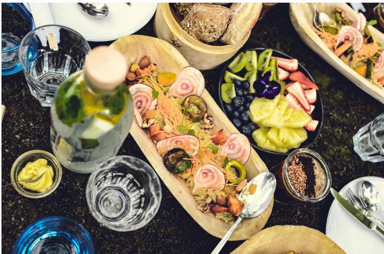
The picnic spread from Santa Bárbara

At this resort in Lisbon's chic suburb of Cascais, the picnics come with something even better: The baskets are mounted on cruiser bikes, that can be ridden to a pretty spot in the forests around the hotel or to nearby Guincho beach. The fee includes the use of a Europcar bicycle for eight hours or a full day, plus a lunch spread that includes hummus, sandwiches, salads, sweets, juice and water.