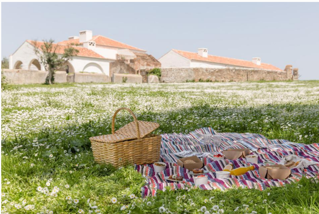
A picnic spread at São Lourenço do Barrocal ASH JAMES

One of the few good things to come out of our current situation is the rise of the big-deal picnic. And as Portugal rolls into its second pandemic summer, hotels across the country have outdone themselves in their efforts to get guests out of their restaurants and into the great outdoors. There's never been a better time—or place—to enjoy an alfresco lunch.