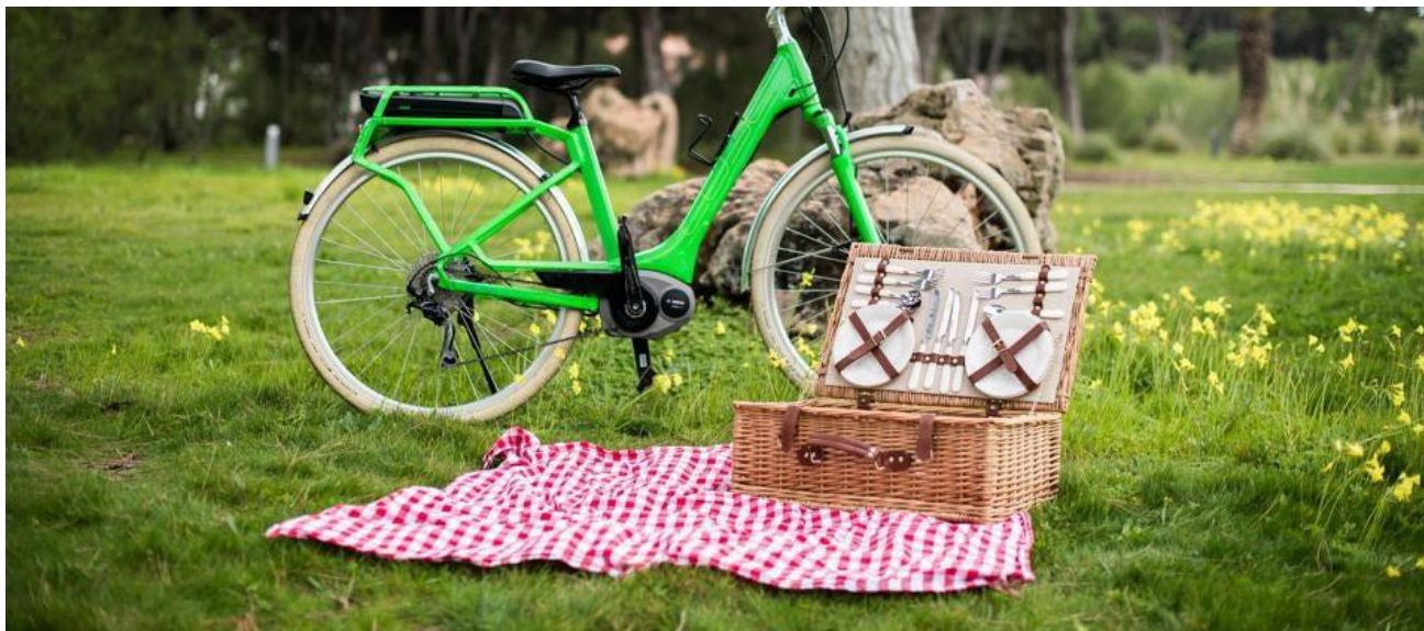
A bike and a picnic from Sheraton Cascais