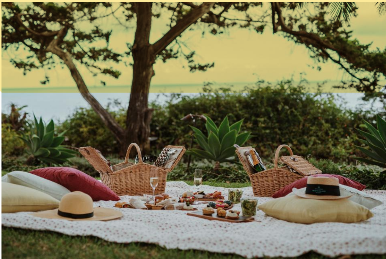
A picnic under the palms at Reid's Palace

traditional meals that the vineyard's workers used to eat, like codfish açorda and roasted meats. Wine from Ventozelo can be included, of course.