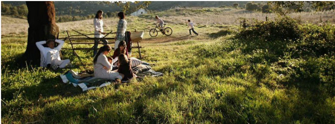
A family picnic at Herdade da Matinha