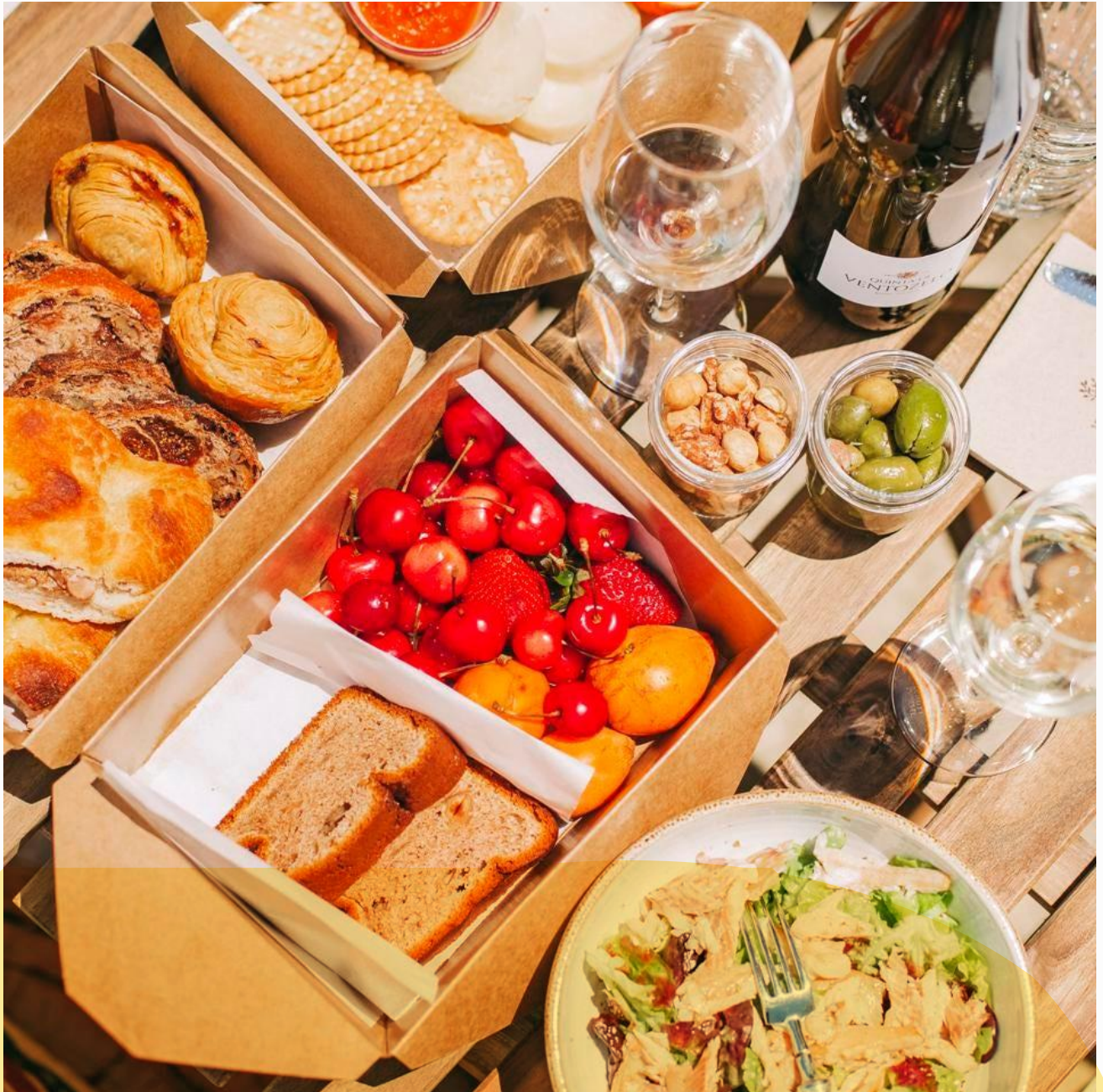
A picnic at Ventozelo

The “chef’s picnic” at this Azores eco-luxury pioneer combines a hike through one of the most stunningly beautiful islands in the Atlantic with a gourmet lunch to go. The boxes include treats that are more interesting than standard picnic fare, such as roast beef sandwiches, burritos with cured and marinated fish and chili aioli, vegetables from the hotel’s own organic farm, the famous Azores cheese, homemade cakes and delectable Pico wines.