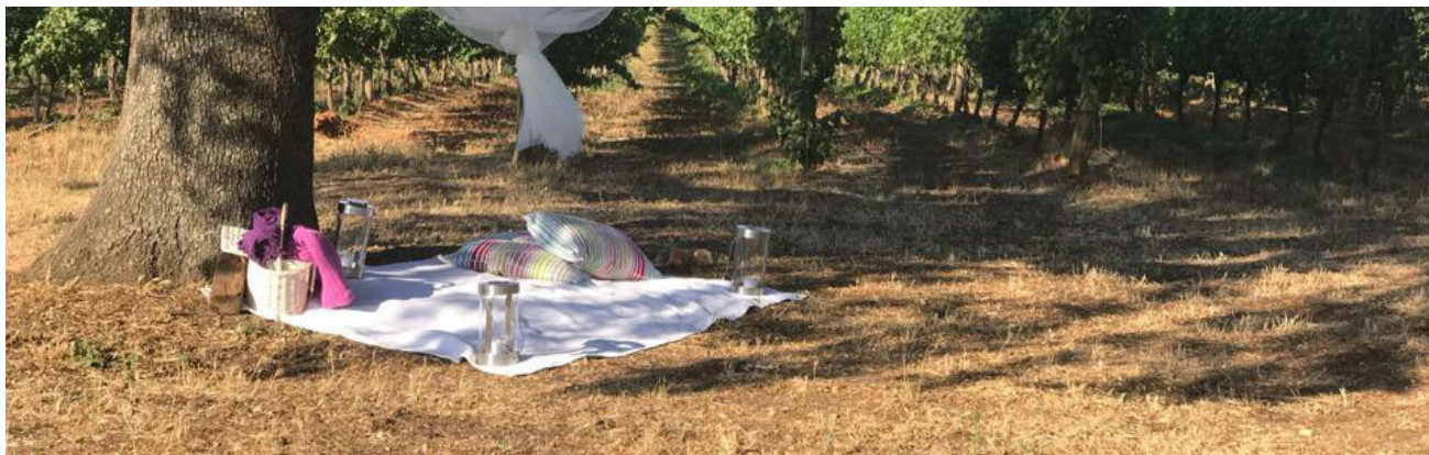
A post-picnic lounge area set up at Herdade da Malhadinha Nova