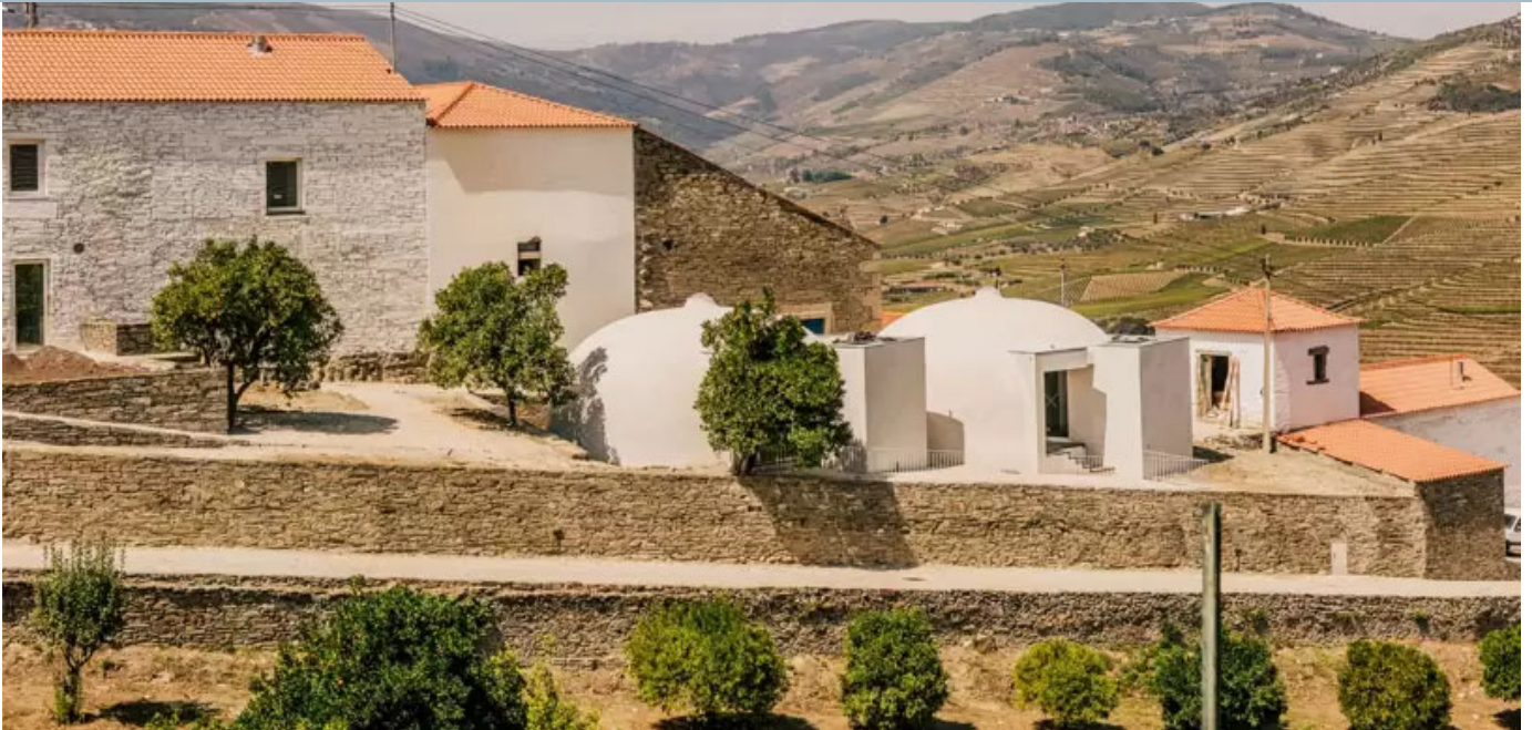
Quinta de Ventozelo